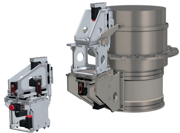
Remove the unit support box (with machining units) and reposition with highest repeatability.

Further flexibility is provided by scalability: customers can start producing with a single cycle Mikron MultiX configuration and add supplementary cycles according to volume growth.