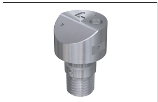
Parts up to 80x80x80mm or Ø65mm L100 can be efficiently machined