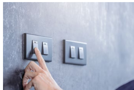
Electrical / Industrial from circuit breakers to quick connectors