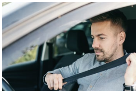
Automotive from gas generators for airbags to fuel injectors