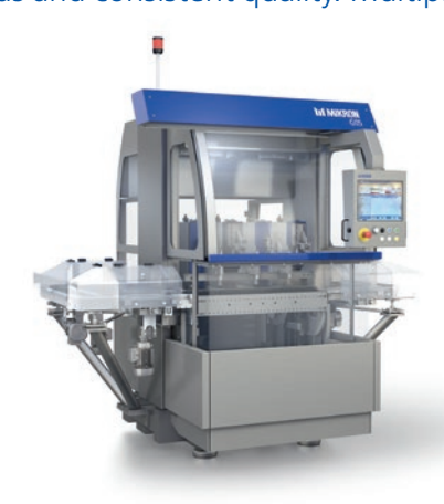
Mikron G05 1 Module

be linked together depending on project requirements which allows full layout flexibility. The linear concepts gives Improved accessibility for material flow both to and from the assembly line and also very quick access for operators and maintenance personal. The use of manual working stations, semi- and fully automatic cells offer progressive investment from pilot to fully automatic lines.