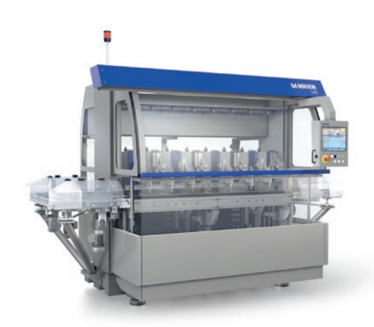
Mikron G05 2 Modules