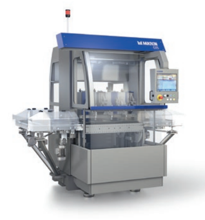
Mikron G05 1 Module

be linked together depending on project requirements which allows full layout flexibility. The linear concepts gives Improved accessibility for material flow both to and from the assembly line and also very quick access for operators and maintenance personal. The use of manual working stations, semi- and fully automatic cells offer progressive investment from pilot to fully automatic lines.