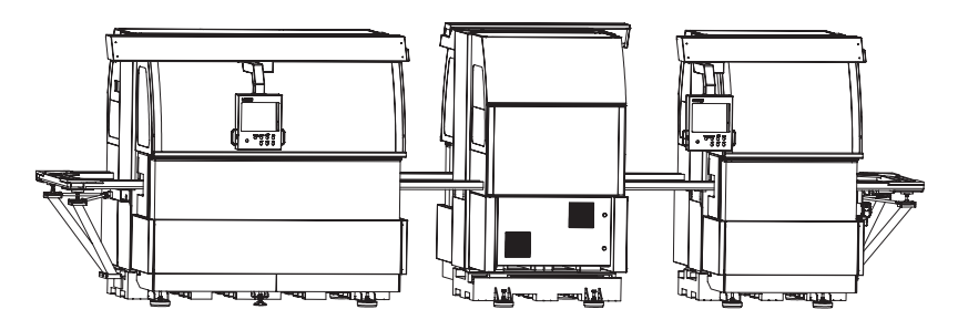
G05 2 modules front - G05 1 module back - G05 1 module front